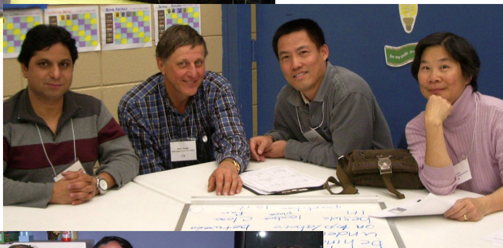
Practice Teaching Sessions