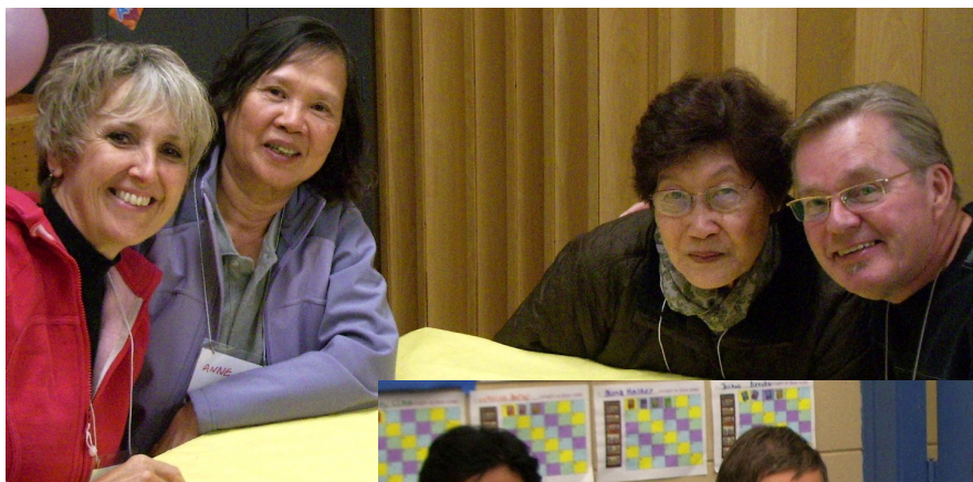
Fall Training 2010